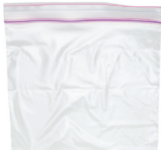
Resealable freezer bag