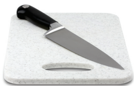
Cutting board and knife