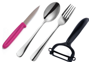
Small knife • Utensils • Peeler