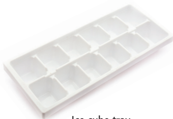
Ice cube tray