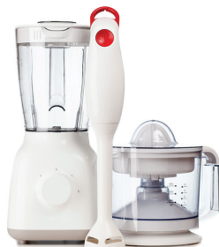
Food processor • Blender